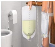
LEG (NIGHT) BAGS ARE USED TO DRAIN URINE INTO ARE USUALLY CONNECTED TO A LEG BAG e.g.

Leg bags can be used for 1 week and then should be changed. When connected to a catheter it is important that the sterile connection is left in place for a week so definitely recommended behaviour. Leg bags are supplied on prescription in boxes of 10 and therefore last for 10 weeks. There is no reason why patients need more than 1 leg bag per week so a box should last 10 weeks. 6 boxes per year would be an acceptable amount. Patients or carers could put the date on the back of the bag when new bag is attached. Suggested dosage instructions, "Each bag should last 5-7 days".