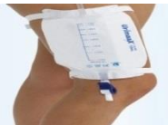
A LEG (DAY) BAG IS USED TO ATTACH TO A CATHETER, SHEATH OR ACTIBRIEF TO COLLECT URINE e.g.