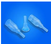
PENILE SHEATH is an external device used for male continence issues

These are all directed to stay in place for 24 hours and are usually supplied in boxes of 30. Some patients do change their sheaths twice per day and this is an acceptable maximum quantity supply in the majority of cases. Patients using more who express that they have issues should be referred to the continence service. Patients do need resizing as they age and may need a smaller sheath (often why it is falling off and they are using more).