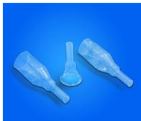
PENILE SHEATH is an external device used for male continence issues

These are all directed to stay in place for 24 hours and are usually supplied in boxes of 30. Some patients do change their sheaths twice per day and this is an acceptable maximum quantity supply in the majority of cases. Patients using more who express that they have issues should be referred to the continence service. Patients do need resizing as they age and may need a smaller sheath (often why it is falling off and they are using more).