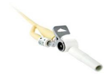
CATHETER VALVE used to attach to a urethral catheter when a leg bag is not needed.

These are all directed to stay in place for 24 hours and are usually supplied in boxes of 30. Some patients do change their sheaths twice per day and this is an acceptable maximum quantity supply in the majority of cases. Patients using more who express that they have issues should be referred to the continence service. Patients do need resizing as they age and may need a smaller sheath (often why it is falling off and they are using more).